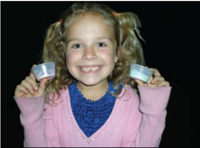
A jar of slime brought a smile to this girl's face in our " Strange Matter " exhibition about materials science. Thanks to support from the Mandell Weiss Charitable Trust, this exhibition has been extended through September