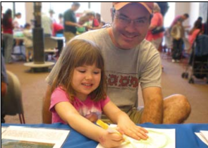
Father and daughter enjoyed Green Day, sponsored by Union Bank of California.